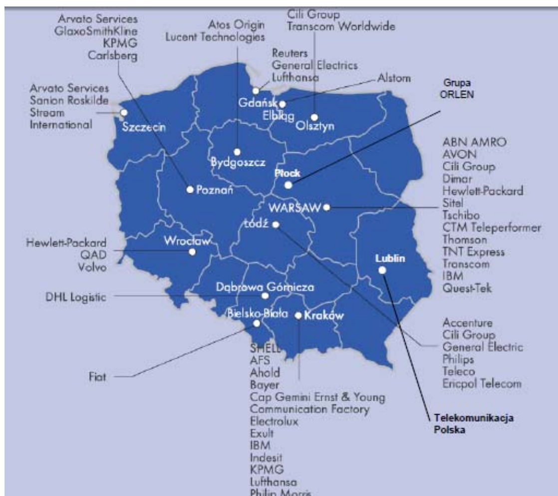
Figure 2. Own service centres established by large companies in Poland

Advantages resulting from outsourcing development in Poland seem to be obvious, so it should be also obvious that this chance given to the Polish economy should be used and authorities have to perform suitable actions in order to prevent stagnation on market or withdraw of capital invested in that field.